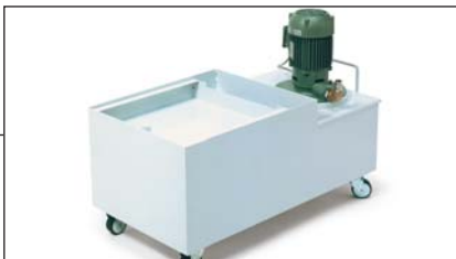
Bac et pompe